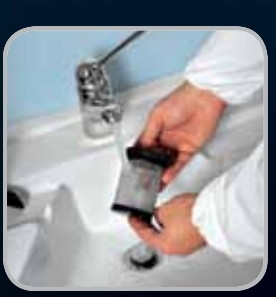
Simple and practical thorough cleaning of the suction filter

Cleaning and maintaining your Genie is effortless thanks to easy tank removal and filter access. The Genies high-quality components ensure long life and reliability, delivering low full life costs. Thanks to the use of plastic materials (polyethylene), aluminium and steel, the components of Genie B never rust.