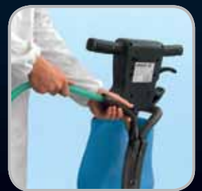
Periodic cleaning of the squeegee hose to ensure efficient suction