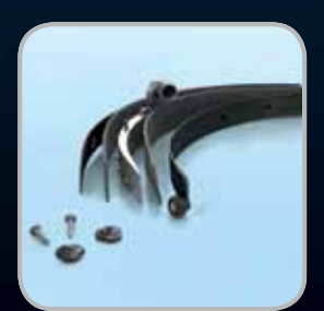
For excellent drying performance, the squeegee rubbers should be always be kept clean. When worn out, the squeegee rubbers are very easy to replace