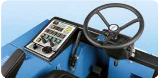
DASHBOARD OF THE BATTERY-POWERED VERSION