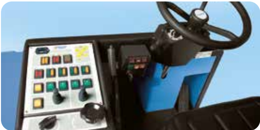
DASHBOARD OF THE DIESEL-POWERED VERSION