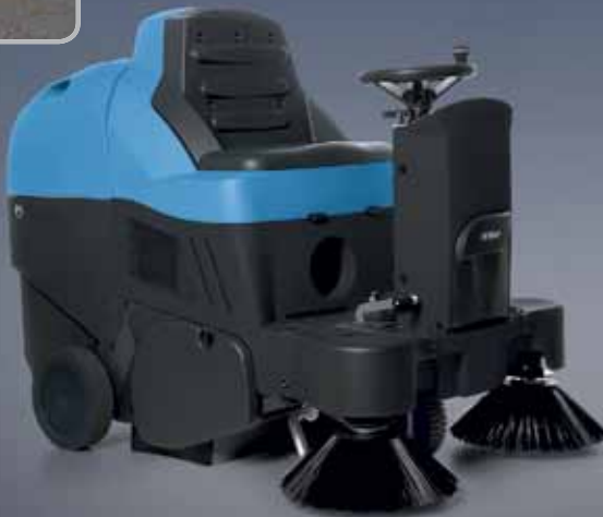
FS700 B (Basic)