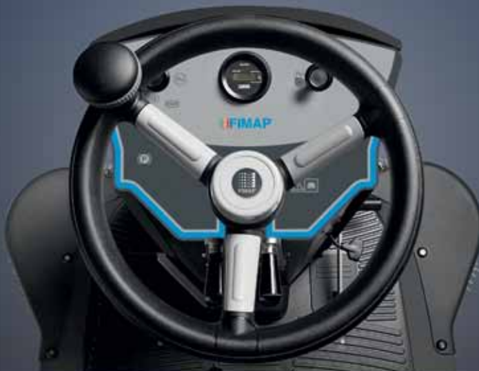
Instrument panel (Basic H version)

The brushes (central and side) are easily moved with the aid of 2 levers