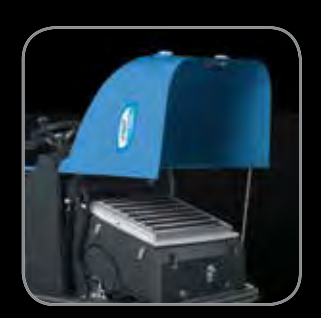
No maintenance thanks to the periodical use of the electric filter shaker

The position of the hydraulic filter (10 micron) has been studied to facilitate maintenance operations. A second filter is positioned inside the oil tank.